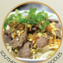
SOUTHERN STYLE BEEF NOODLES