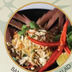
BANANA BLOSSOM SALAD

(N) Tofu and vegetables salad / Xà lát rau & đậu phụ chiên VND 105 Fried tofu with crunchy vegetables