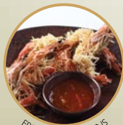
FRIED TIGER PRAWNS