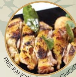
FREE-RANGE MOUNTAIN CHICKEN

Prices are quoted in thousands of VND and are subject to 5% service charge and 10% government tax Giá niêm yết bằng nghìn Việt Nam đồng, chưa bao gồm 5% phí dịch vụ và 10% thuế VAT