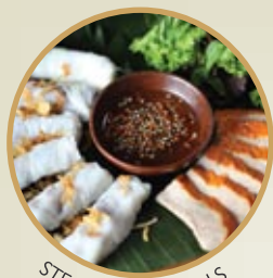
STEAMED RICE ROLLS