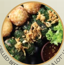
GRILLED BEEF WRAPPED IN “LA LOT” LEAF