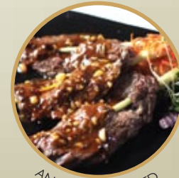
ANGUS BEEF GRILLED