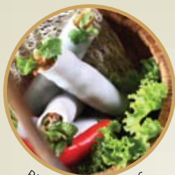
RICE NOODLE ROLLS

(G) Hanoi fresh rice noodle rolls with beef and fresh herbs Phở cuốn thịt bò rau thơm VND 130