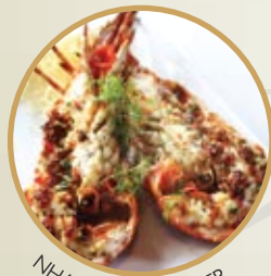
NHA TRANG LOBSTER