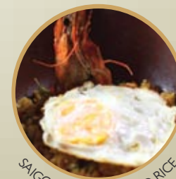
SAIGON'S SPECIAL FRIED RICE