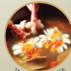
TREASURE OF THE SEA

Sweet corn and vegetables soup / Súp ngô non VND 105 Whole kernel corn, fresh mushroom and vegetables soup Súp ngô non nấu nấm tươi và rau