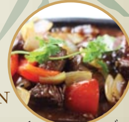
ANGUS BEEF "LUC LAC"