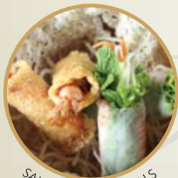
SAIGON SPRING ROLLS

Prices are quoted in thousands of VND and are subject to 5% service charge and 10% government tax Giá niêm yết bằng nghìn Viet Nam đồng, chưa bao gồm 5% phí dịch vụ và 10% thuế VAT